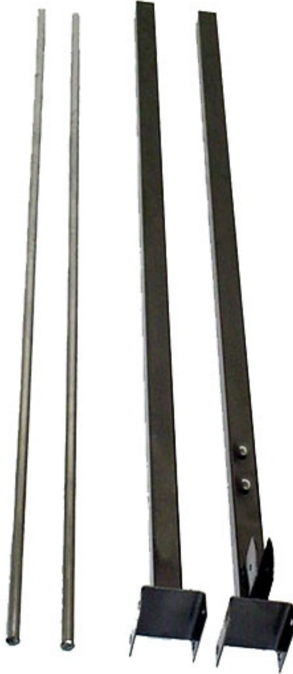
WEIGHT BARS 2PCS